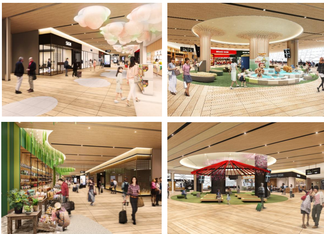
Rendering of extended international commercial area

Kansai Airports Group will continue to collaborate with partners to create new travel experiences as the gateway to the Kansai region, welcoming guests from Japan and around the world.