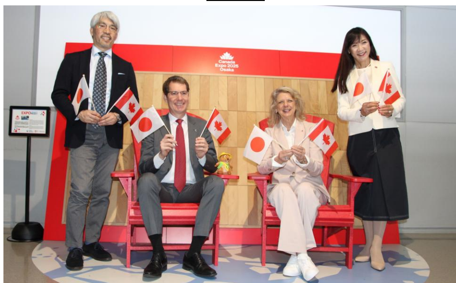
Photo of the ceremony