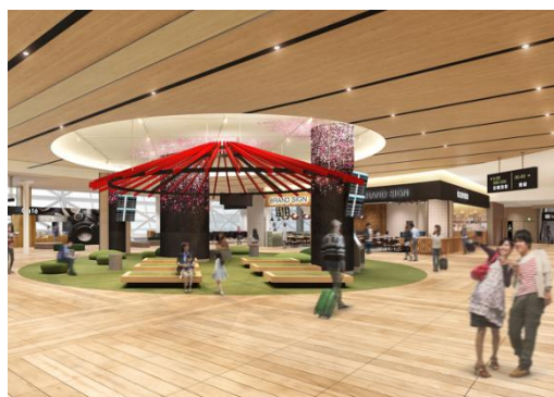
Rendering of extended international commercial area